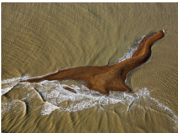
This sea monster is composed of sand and shingle in the mouth of the River Ore, but it creeps around to trap the unwary sailor.