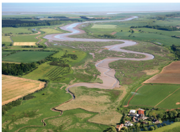
Butley River looking towards Havergate Island.