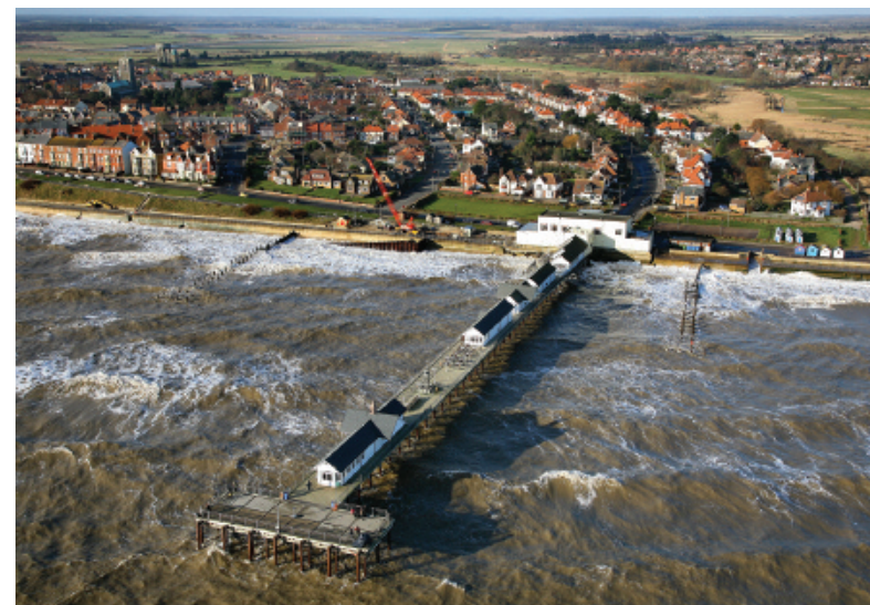
Rough seas Southwold.